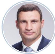
AUC Chairman Kyiv City Mayor Vitaliy Klitschko